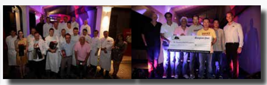
2015 Bangkok Post-Black Mountain Charity Golf and Gourmet Dinner Bangkok Post Foundation, in collaboration with Black Mountain Golf Club, Hua Hin, organised the 2015 Bangkok Post-Black Mountain Charity Golf and Gourmet Dinner on 10 January 2015, at Black Mountain Golf Club, Hua Hin. All proceeds from the event, totalling 4 million baht, were donated to the Bangkok Post Foundation to support education for disadvantaged children.