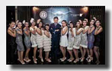
The 8<sup>th</sup> Bangkok Post Charity Wine Dinner The 8<sup>th</sup> Bangkok Post Charity Wine Dinner was held at JW Marriott Hotel Bangkok on 2 November 2015, with all proceeds being donated to the Bangkok Post Foundation.